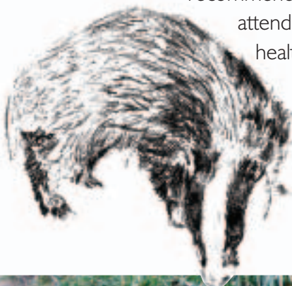
Top: Water vole Top right: Red squirrel Right: Checking dormouse boxes Left: Badger Bottom: Badger sett (disused)